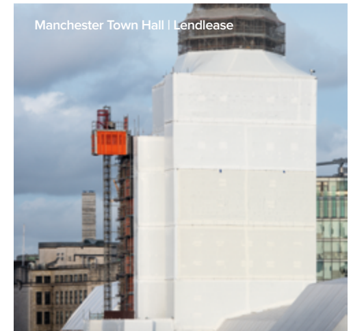
Manchester Town Hall | Lendlease