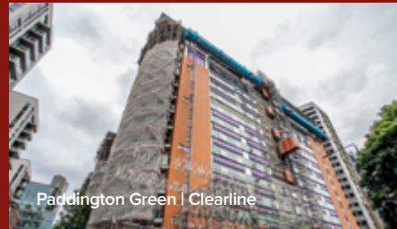
Paddington Green | Clearline

Brand Access Solutions is a proud part of BrandSafway, one of the world's leading providers of access solutions. In the UK, our hoist operation seamlessly integrates into the well-established framework of Brand Access Solutions, the country's largest provider of scaffolding and access services for commercial and infrastructure projects.