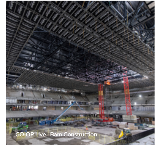
CO-OP Live | Bam Construction

Solution: We worked in collaboration with the crane sub-contractor and a section of tower crane mast was provided to allow our twin passenger hoist to be stabilised and secured safely. Brand Access Solutions Branch Manager said: "This is one of those solutions that you can't believe can be possible, but our experienced and talented engineering team have made the vision a reality – achieving safe vertical access as desired by the client on this landmark project."